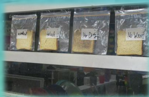
Germ safety science experiments