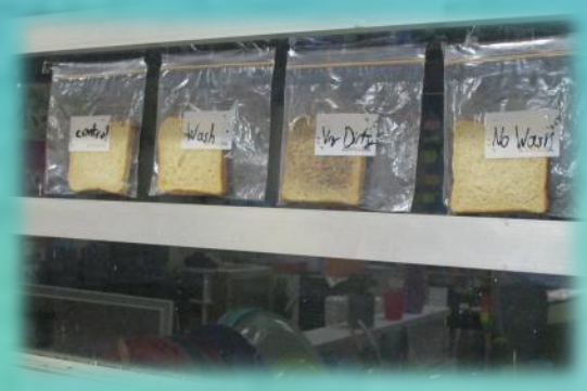
Germ safety science experiments